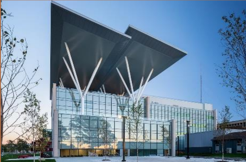
Mohawk College Joyce Center for Innovation Hamilton, Ontario