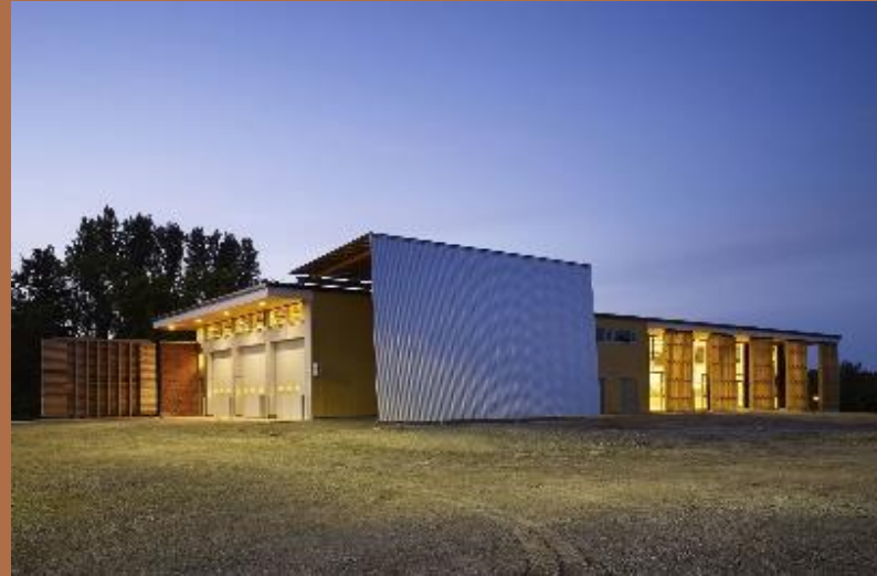
TRCA Restoration Services Building Vaughan, Ontario