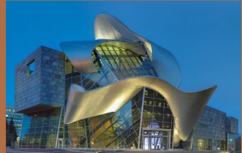
Art Gallery of Alberta Edmonton, Alberta