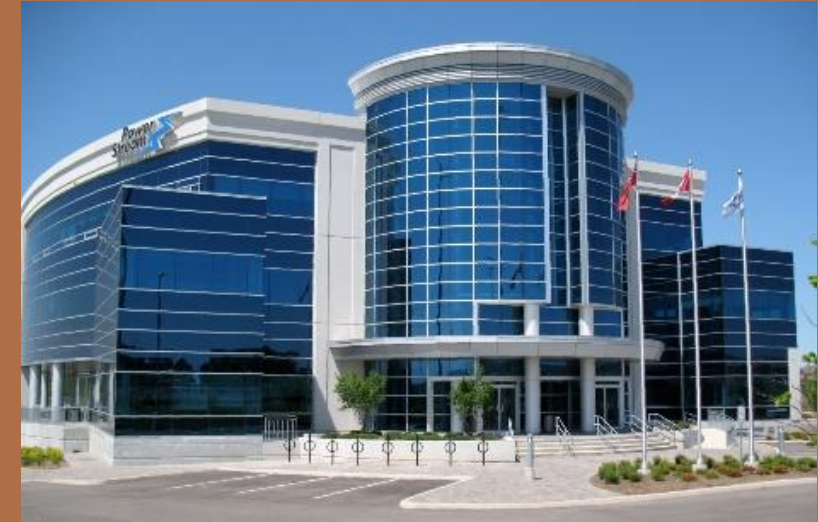
PowerStream (Alectra Utilities) Head Office Vaughan, Ontario