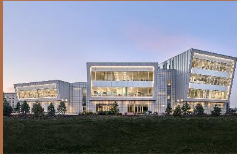
Headquarters – Alberta Union of Provincial Employers West Edmonton, Alberta